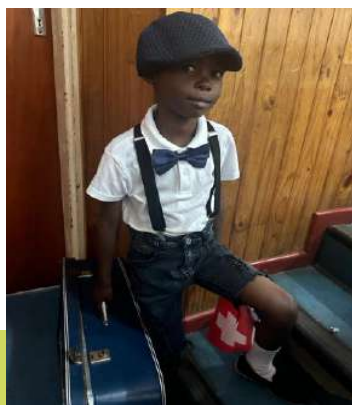
"Zenzele's Magical Evening"